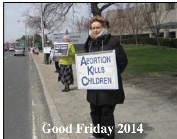
Good Friday 2014

April 3, 10:30 AM-Noon (rain or shine - signs provided). Nassau Univ. Med. Ctr. Pro-life women, men and children stand in peaceful witness to the loss of children sacrificed by abortion at this hospital and throughout L.I. Nearly one baby an hour is dying from abortion in Nassau and Suffolk. We stand on the public sidewalk (2201 Hempstead Tpke., E. Meadow) as a reminder that abortion is not healthcare. Call 631-243-1435 or e-mail fortyDFLLI@gmail.com. Sponsor: LI Coalition for Life.