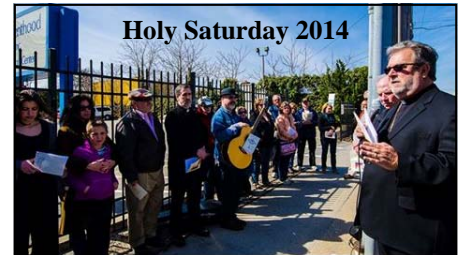
Holy Saturday 2014

of the Intercessor 516-599-3780 seekfirst@verizon.net