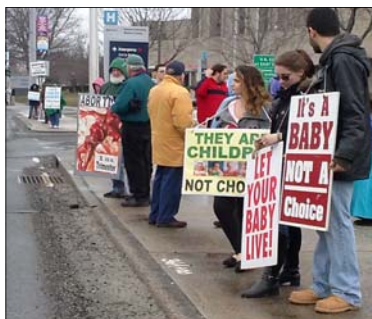
Good Friday Face the Truth at NUMC 4/3/15 2016 date: 3/25/16