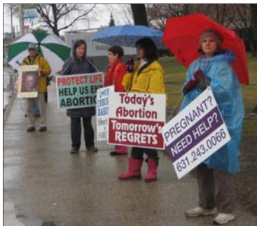
Face the Truth at NUMC 1/18/15 2016 date: 1/24/16

Thanks to the many who answer the call, the many who join LICL in presenting a constant, visible, pro-life message through Nassau and Suffolk.