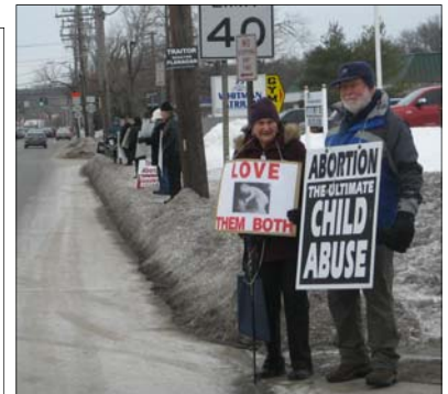
Love Them Both witness New York Ave., Huntington 2/14/15 2016 date: 2/13/16 W. Islip PP