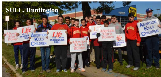
Stand Up For Life 10/4/15 2016 date: 10/2/16