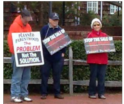
Unmasking Planned Parenthood Bethpage 10/27/15

Many participants at the LICL's Stand Up for Life event signed our petitions to stop government funding of abortion. These petitions have been sent to Senators Schumer and Gillibrand as well as to Long Island Congressional Representatives. Thank you for letting your voice on this matter be heard!