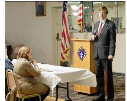
"End of Life" Seminar 2/7/15