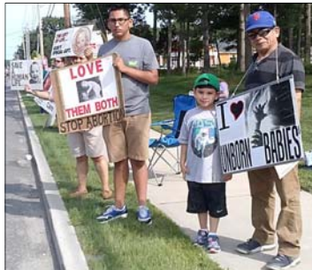
Pre-Independence Day Face the Truth Manorville 7/3/15 2016 date: TBA