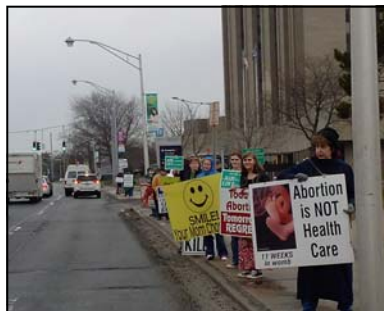
Good Friday 2015

March 25, 10:30 AM -Noon (rain or shine) in front of Nassau University Medical Center (2201 Hempstead Tpke., East Meadow). Pro-life women, men and children take part in this peaceful vigil for the protection of