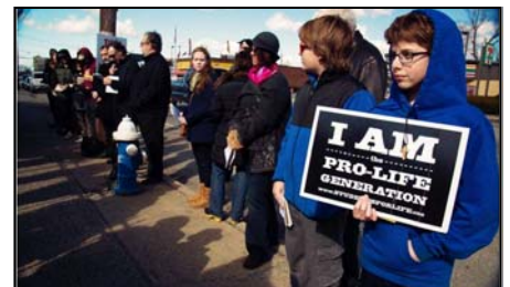
Holy Saturday 2015

Sat., March 26 10 AM in front of Planned Parenthood, 540 Fulton Ave., (Rt. 24), Hempstead. Sponsored by Cathedral Church