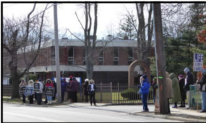
Prayer Vigil in front of Planned Parenthood, Smithtown on January 22, 2015.

Neither rain nor snow nor sleet nor hail - no we aren't talking about the USPS, we're talking about the dedicated pro-life people around our Nation and those shown in the photos below.