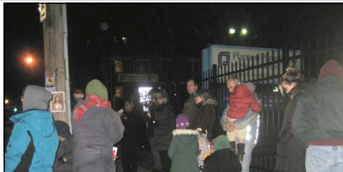
Pro-lifers gathered outside Hempstead Planned Parenthood for a candlelight vigil on the Feast of the Holy Innocents (12/28/2013). About 35 pro-lifers prayed the Rosary and sang Christmas hymns.

No fees. Bring bible. Light refreshments. All calls confidential.