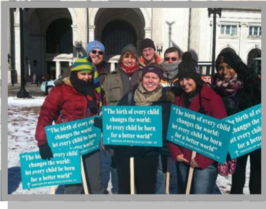
Students from Stony Brook University's Catholic Campus Ministry at the 2014 March for Life in Washington, D.C.

Hazardous driving conditions in Nassau and Suffolk forced cancelation of all buses scheduled to leave on Wed. 1/22 to attend the March for Life. Several student groups left a day or so earlier and participated in the