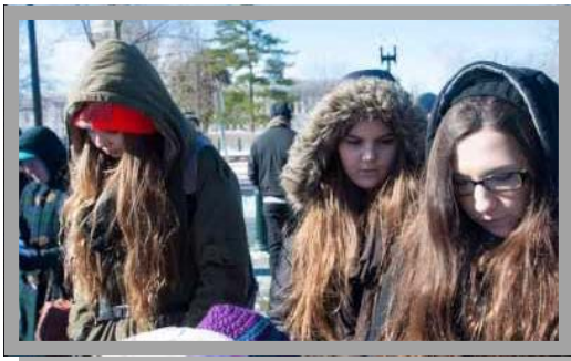
Young adults from Church of the Intercessor, Malverne, at the 2014 March for Life in Washington, D.C.

Braving the cold, speakers including religious leaders of many faiths (Pope Francis tweeted his support), Senate and House Members, and pro-life leaders spoke words of encouragement. Marchers from France, Italy, Belgium the Netherlands, Canada and Lithuania stated this march influences people around the world. Mini Marches and Rallies in opposition to Roe v. Wade were held in San Francisco (50,000-60,000), Nebraska, Wisconsin, Georgia, Washington state and Idaho.