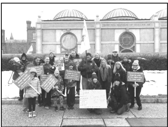
Our Lady of the Snows, Blue Point w/neighboring parishes & groups