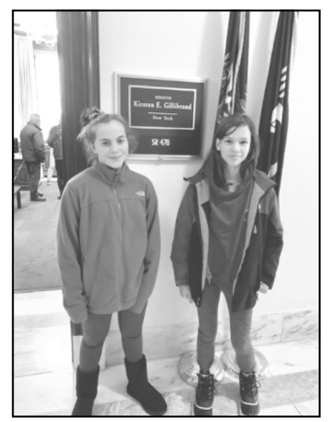
Youth from St. Philip Neri, Northport