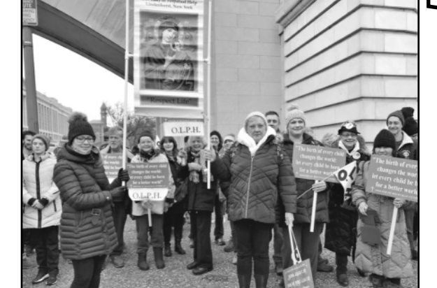
Our Lady of Perpetual Help, Lindenhurst

Thank you to all who went to the March for Life 2019 in DC and thank you to all who couldn't make the trip but participated in other local pro-life events and/or prayed wherever they were.